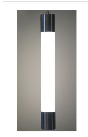
RAD-A WITH BOTTOM CAP